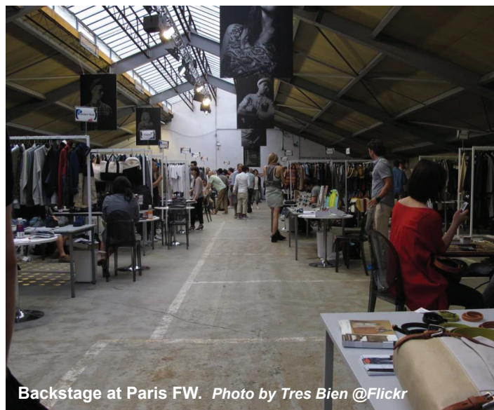
Backstage at Paris FW.

MILAN FASHION WEEK Also known as Milano Moda Donna, MFW has an extra special flavour as many fashion events take place in outdoor venues; the Milan palazzos (palaces) and piazzas (squares). Adding to that, the public audience can enjoy the fashion shows via large display screens in various city points. Designers such as Gucci, Armani, Roberto Cavalli, and Versace are regulars here. When? The semi-annual event will be first held from February 25th to March 3rd for the Autumn-Winter 2015 collection and then from September 23rd-29th for Spring-Summer 2016.