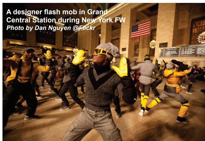
A designer flash mob in Grand Central Station during New York FW